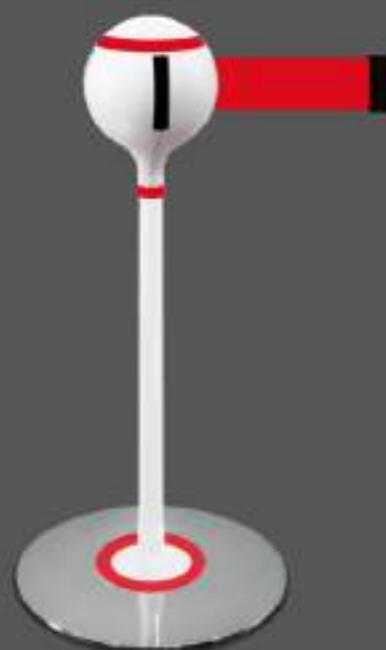
Details and webbing: RED

Sphere: white Post: white Base: polished chrome