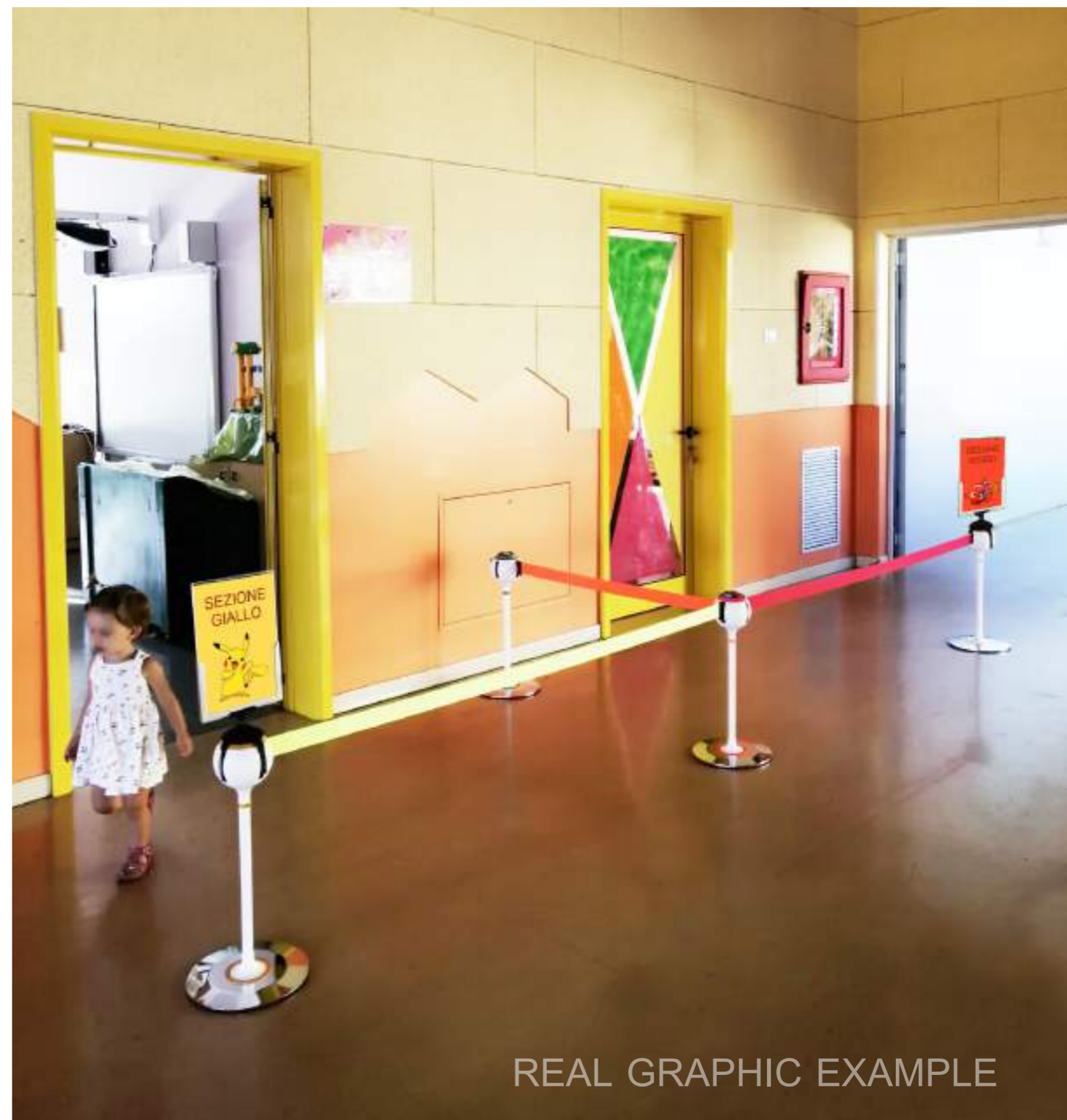
REAL GRAPHIC EXAMPLE