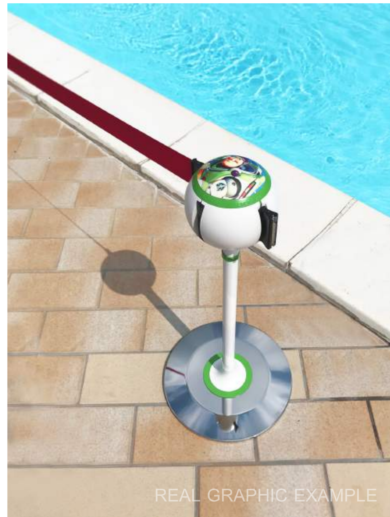
REAL GRAPHIC EXAMPLE