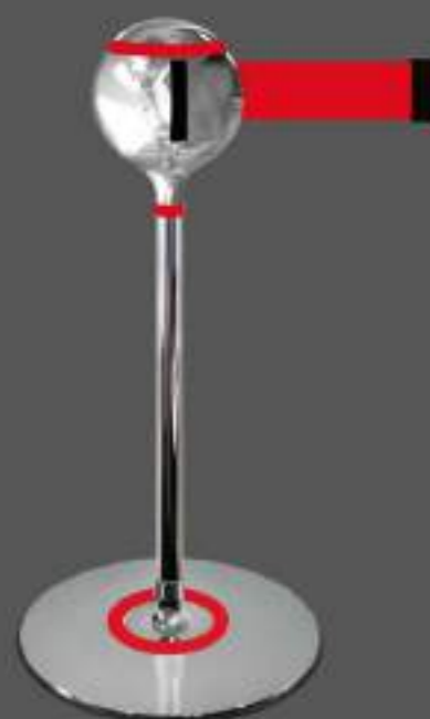
Details and webbing: RED

Sphere: polished chrome Post: polished chrome Base: polished chrome