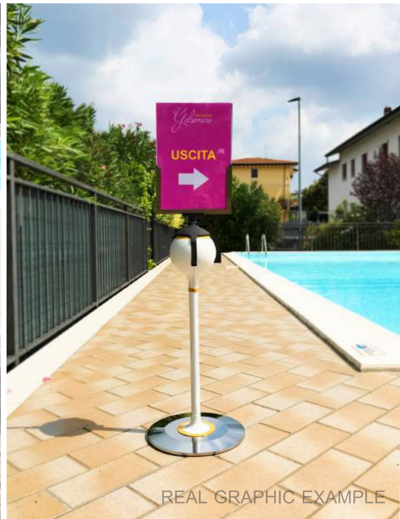
REAL GRAPHIC EXAMPLE