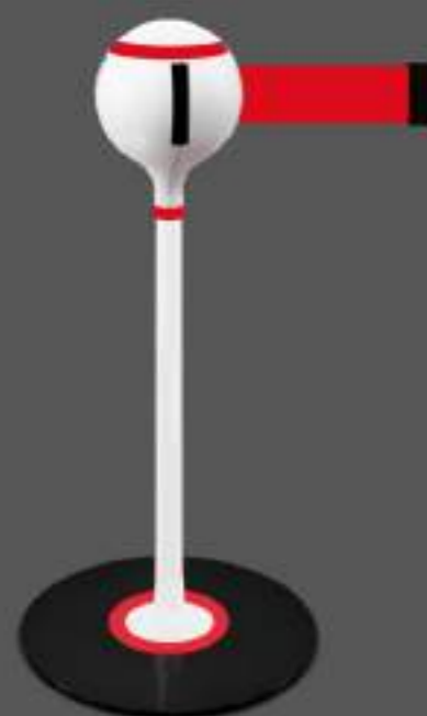
Details and webbing: RED