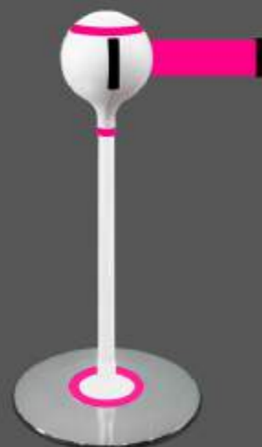
Details and webbing: FLUO PINK