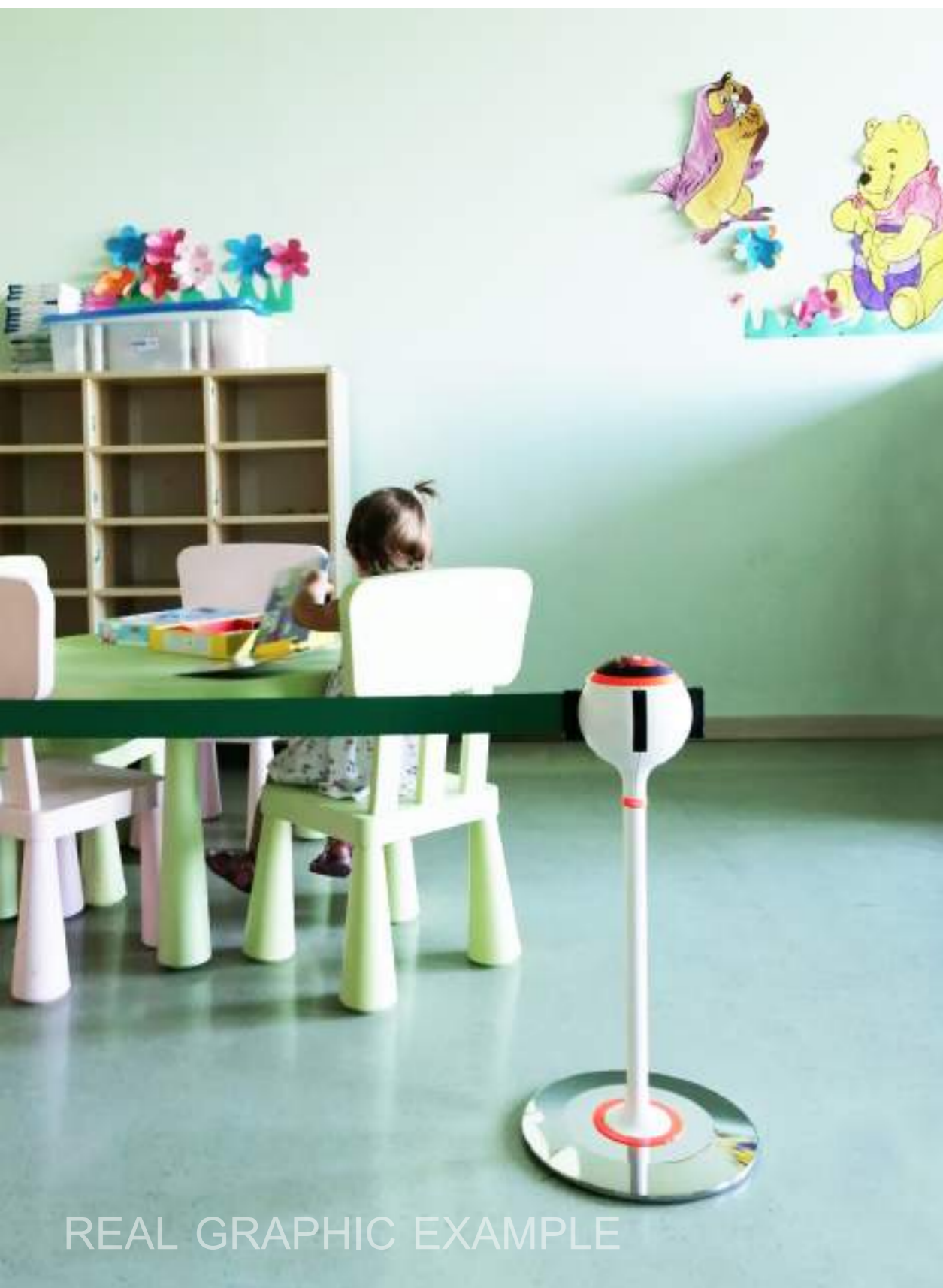
REAL GRAPHIC EXAMPLE