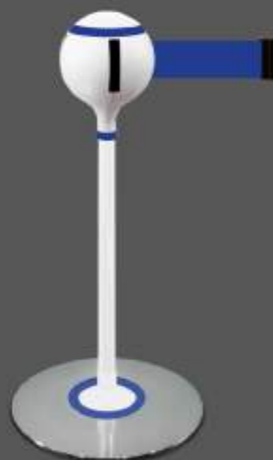
Details and webbing: BLUE