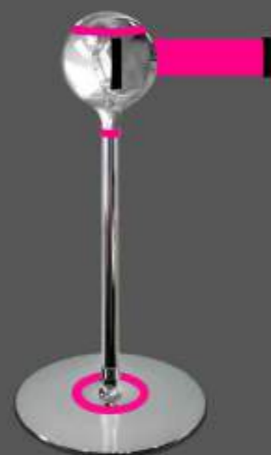
Details and webbing: FLUO PINK