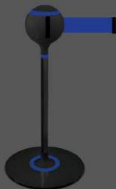
Details and webbing: BLUE