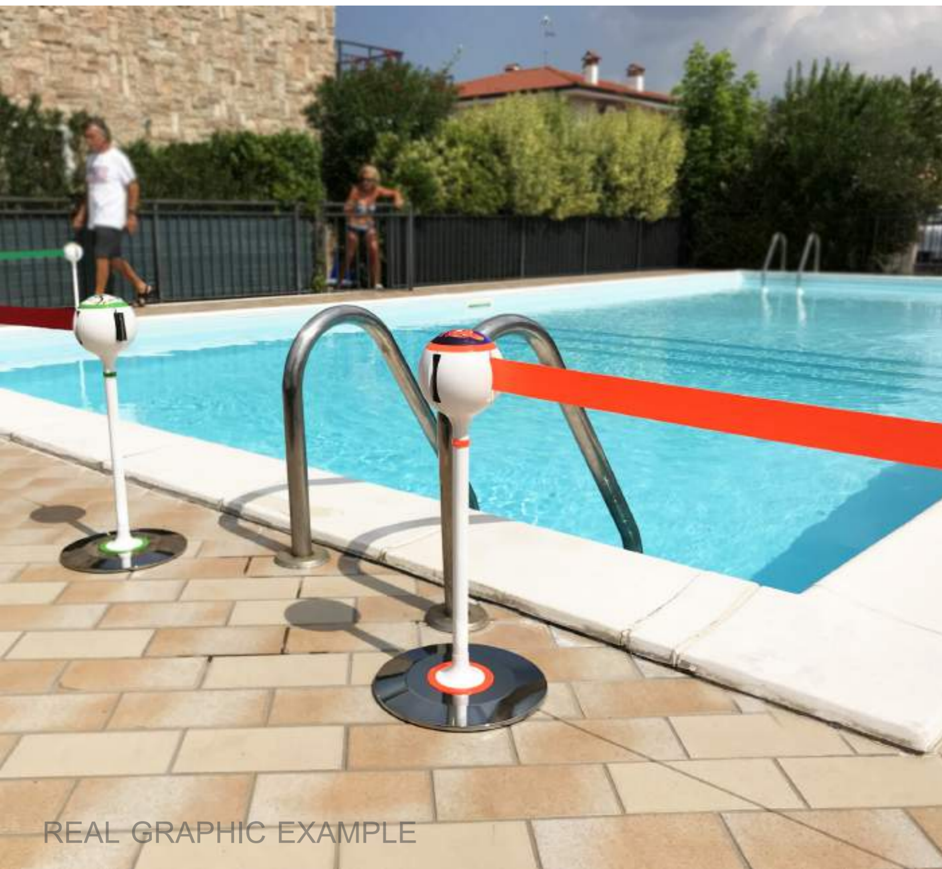
REAL GRAPHIC EXAMPLE