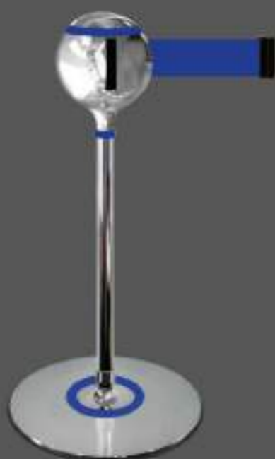
Details and webbing: BLUE