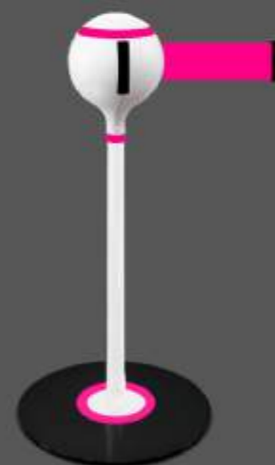
Details and webbing: FLUO PINK