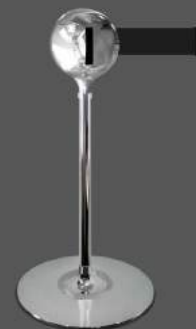
Details: POLISHED CHROME Webbing: BLACK