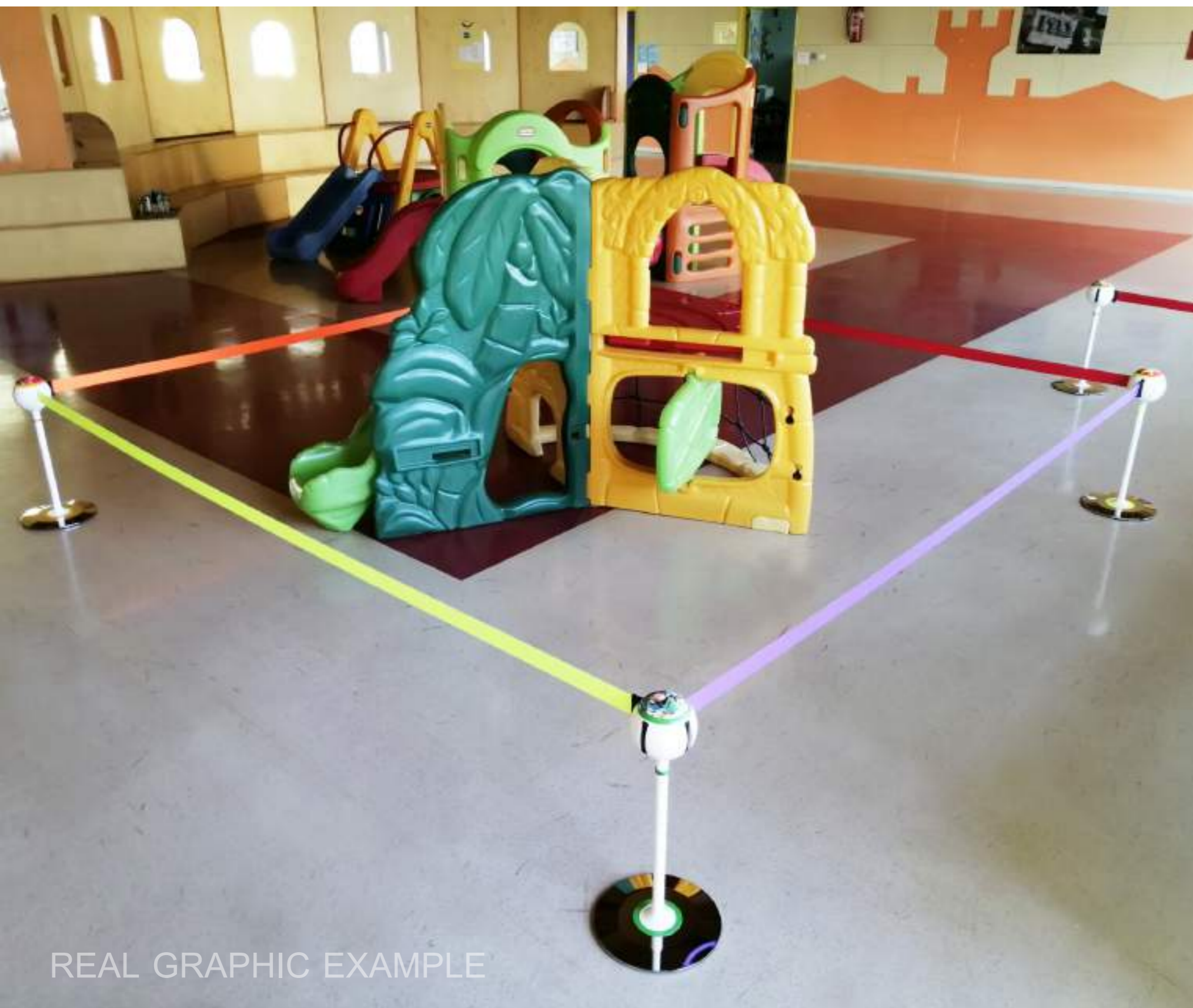
REAL GRAPHIC EXAMPLE