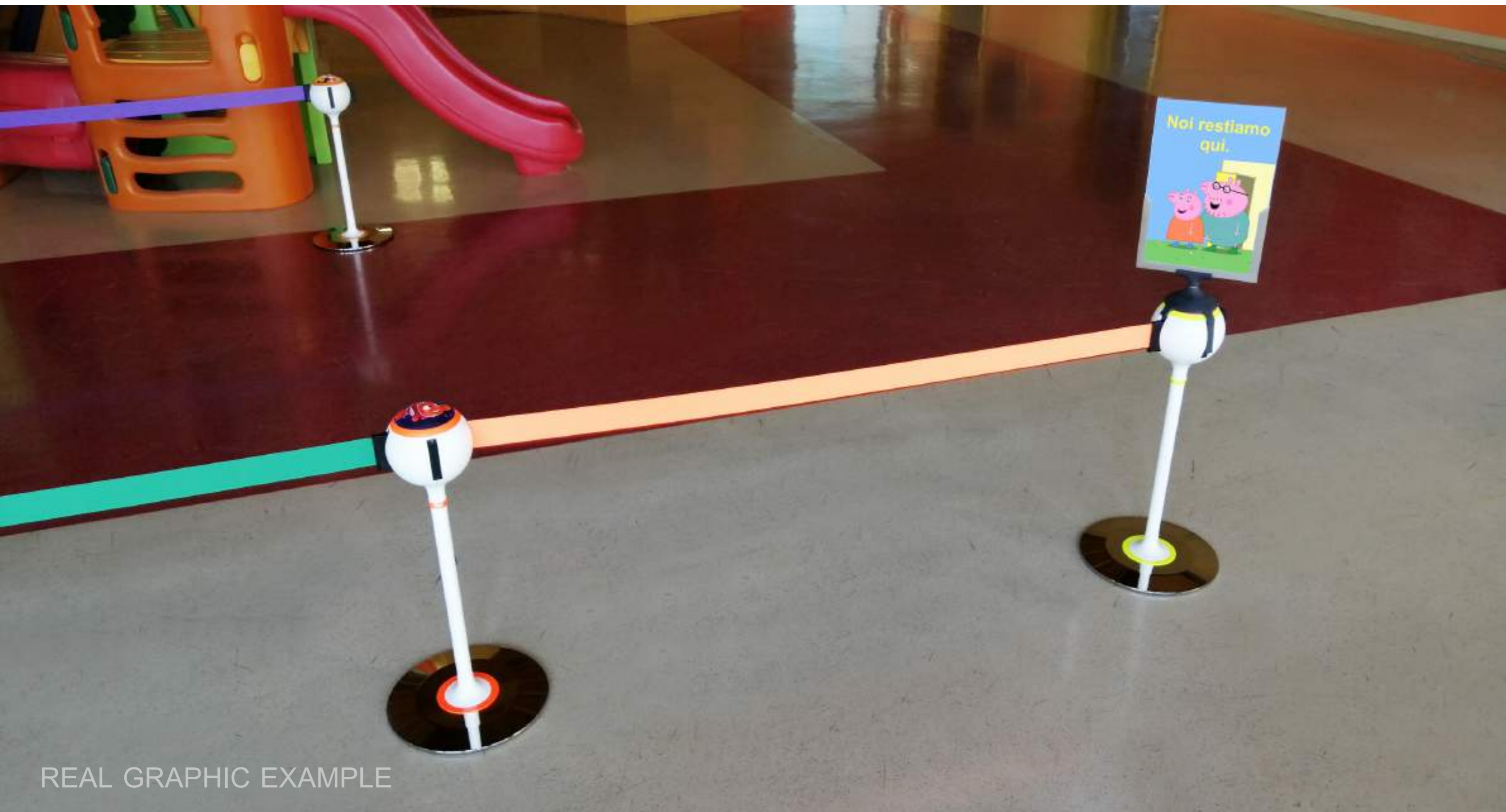
REAL GRAPHIC EXAMPLE