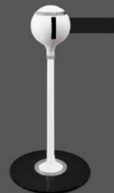
Details: POLISHED CHROME Webbing: BLACK