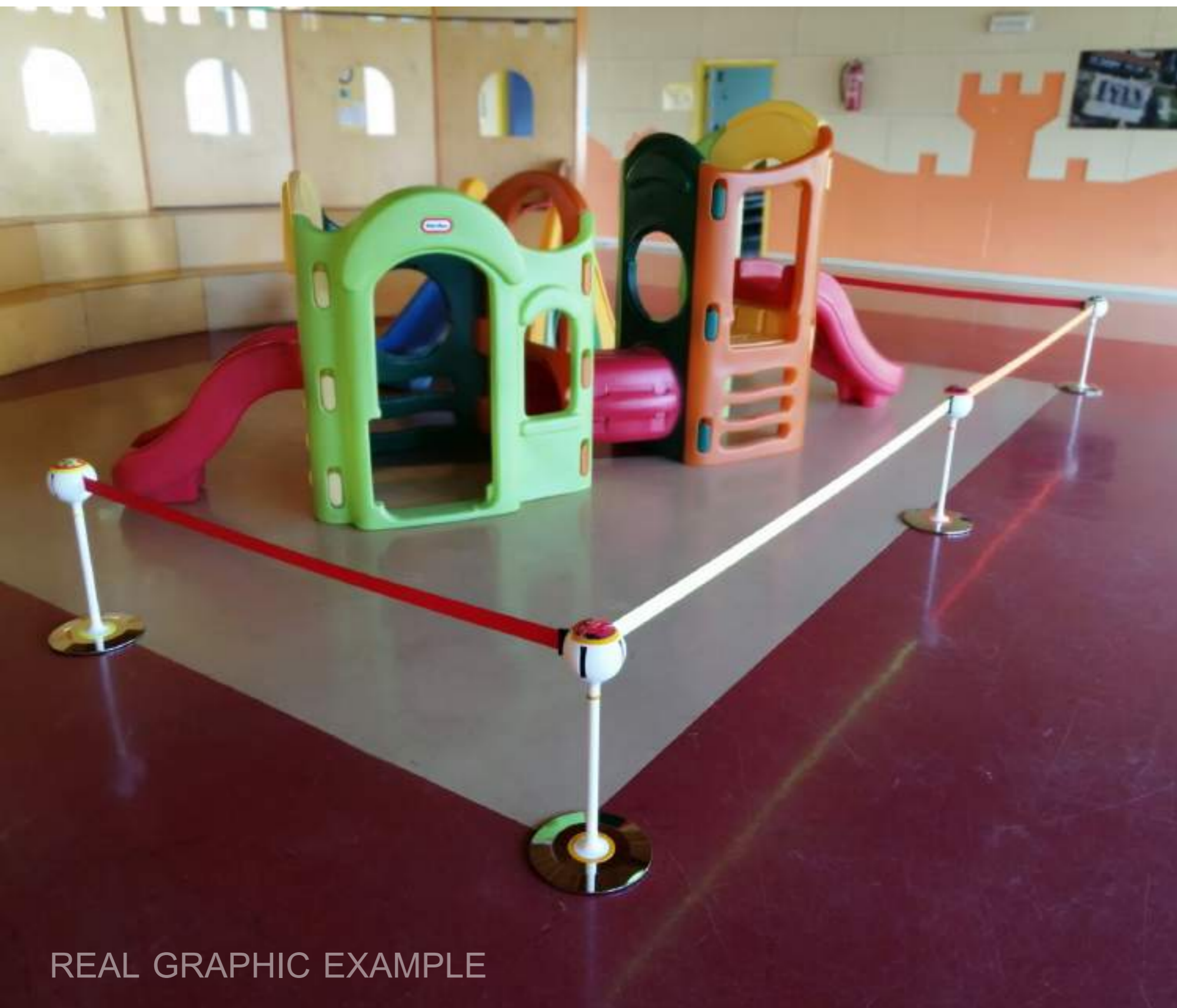
REAL GRAPHIC EXAMPLE