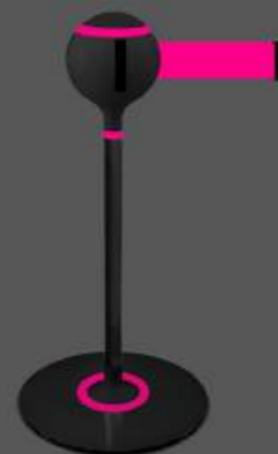
Details and webbing: FLUO PINK