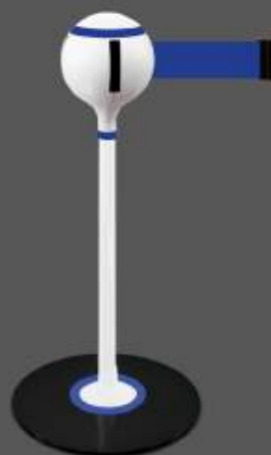
Details and webbing: BLUE