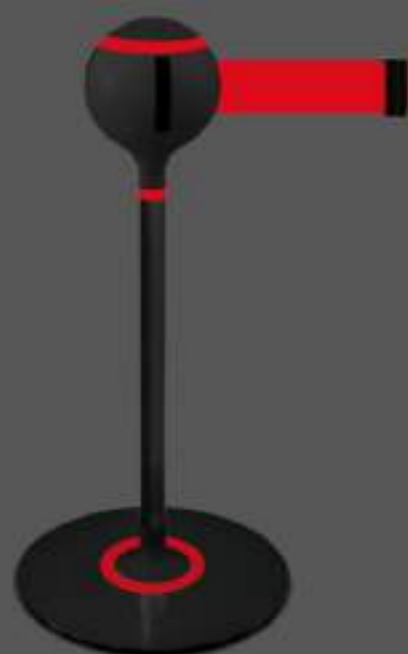
Details and webbing: RED