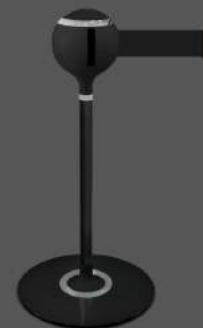
Details: POLISHED CHROME Webbing: BLACK