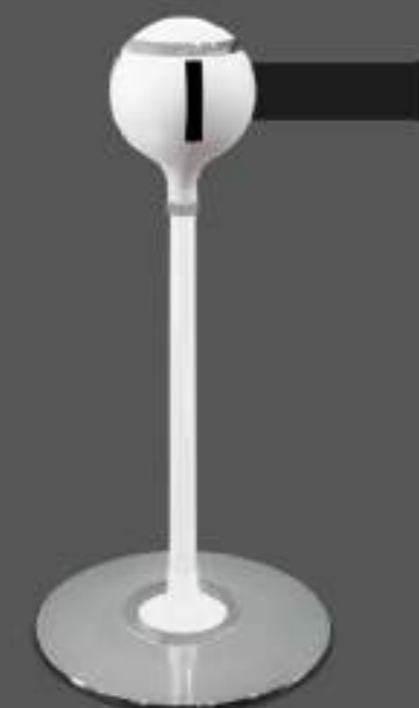
Details: POLISHED CHROME Webbing: BLACK